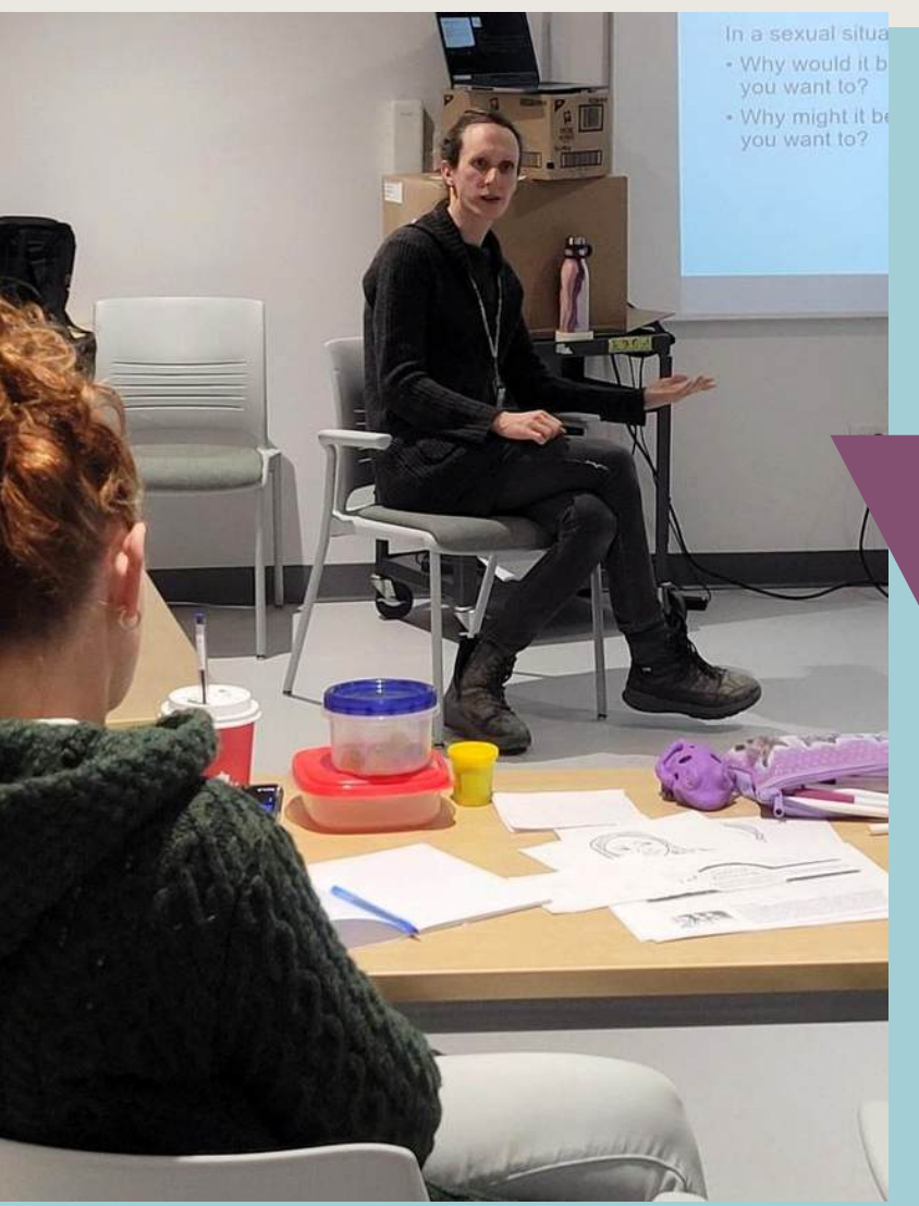
Photo: J Fiedler (Sexuality and Reproductive Health Facilitator) during a session for service providers.

of trained service providers surveyed reported that they had experienced moderate or significant growth in confidence to work with clients and communities