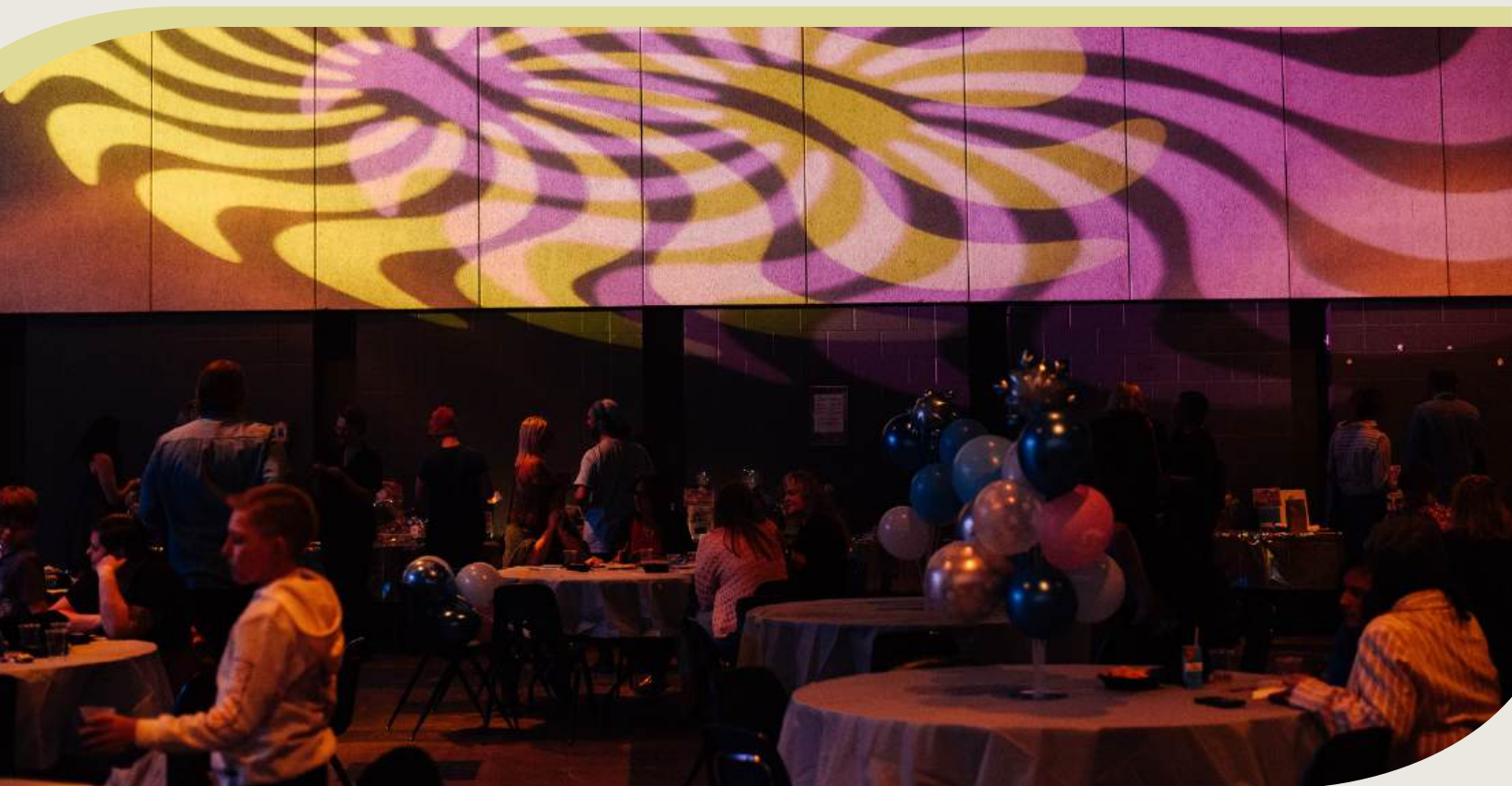
Photo: from A Sparkling Winter Night: SERC's 90 th Anniversary Social.